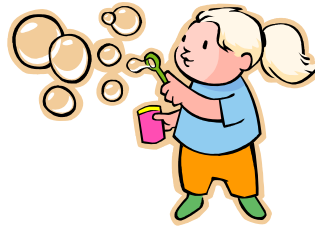
Resources for Young Children

for years ( http://letsplay.buffalo.edu/index.html ). If you haven't been there for awhile, it's worth going back. A look at the heading titles; Play, Selecting Toys, Universal Design, Assistive Technology and Resources , gives you an idea of the types of resources available on this site. Further exploration provides simple information with opportunities for a more in-depth focus ("Getting